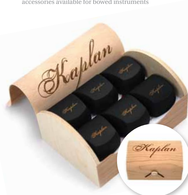
Kaplan Premium Light and Dark rosins still remain available in their individual packaging (KRDL and KRDD).